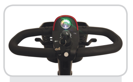
Wraparound delta tiller