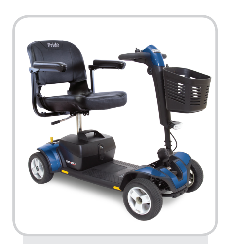
Go-Go® Sport 4-wheel