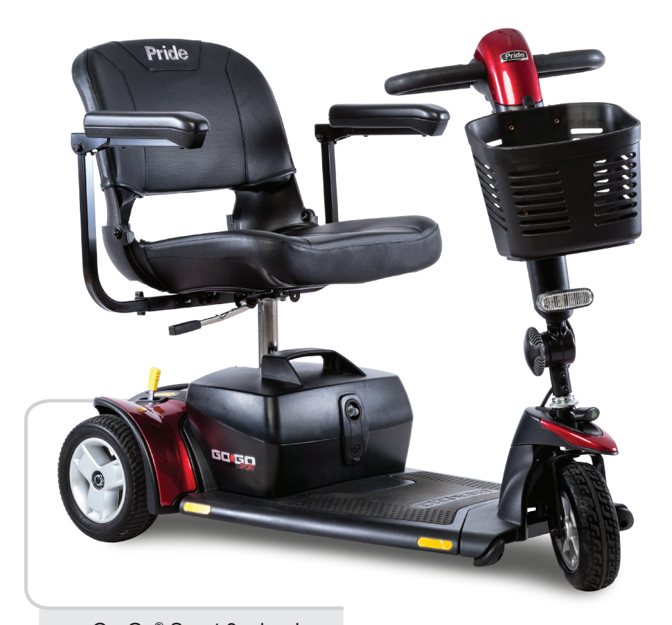
Go-Go® Sport 3-wheel

The Go-Go® Sport delivers high-performance and convenience on the go. With a 325 lb. weight capacity, a charger port in the tiller, standard front LED lighting and a maximum speed up to 4.7 mph., the Go-Go® Sport is feature rich and travel ready.